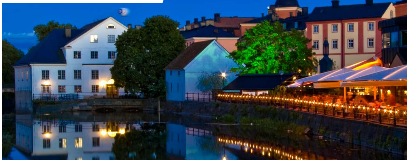
Summer night in Uppsala

In the past there has been numerous World- and European Championship in different sports.